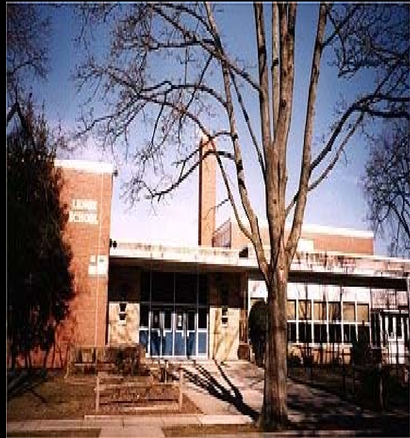
Lenox Elementary School Baldwin UFSD